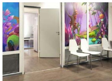
ImagePerfect window and wall medias