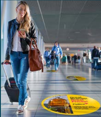
ImagePerfect 2595R9 FloorMinder