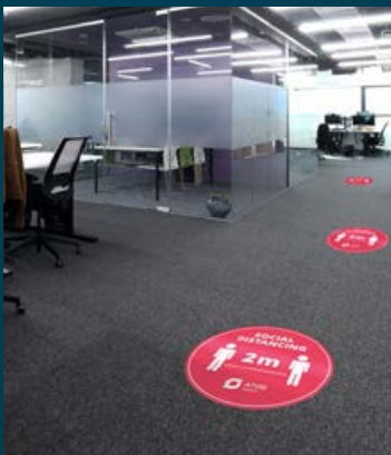
ImagePerfect 2595R9C CarpetApp