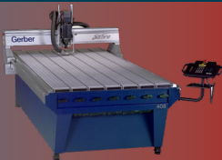
Gerber Sabre® Routers