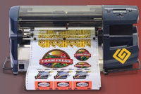
Gerber enVision™ Series Plotters