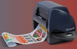
GERBER EDGE Series Thermal Transfer Printers